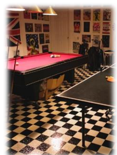
The fully-equipped kitchen, spacious living room, separate dining area, luxurious master bedroom and the unbeatable games room